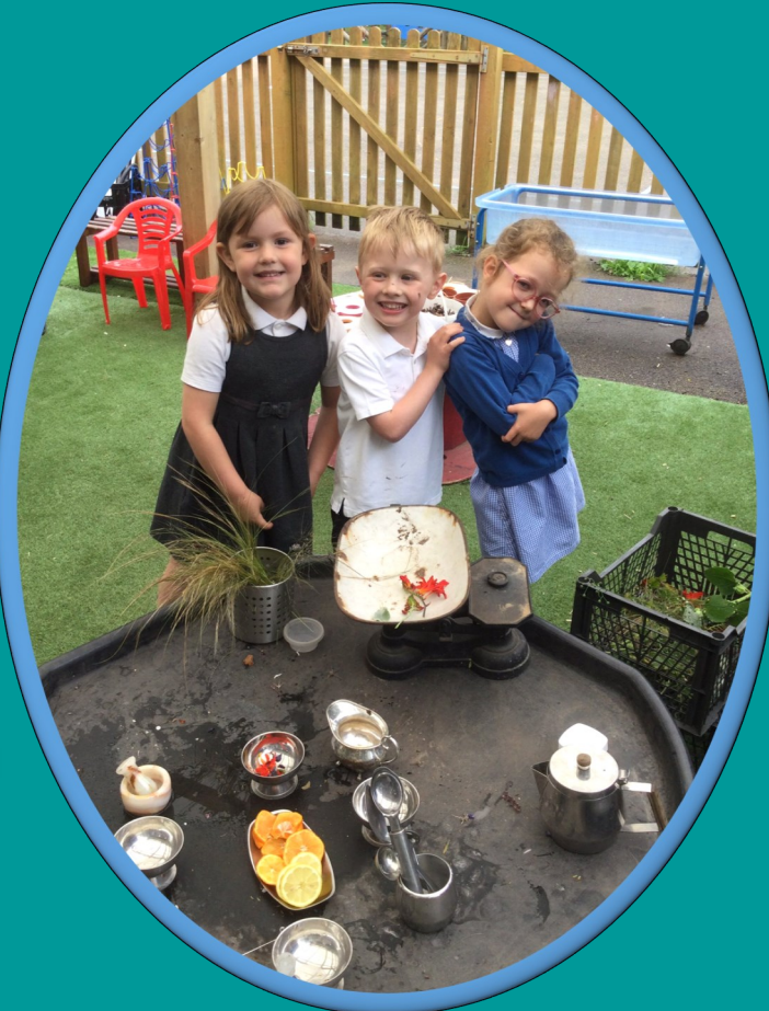
Ladybirds set up a juice bar in the outdoor classroom as part of this term's topic.