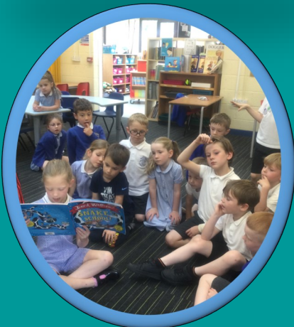
Storytime in Hedgehogs