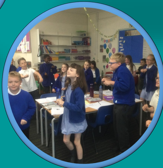
Otters in English were asked how they would show their emotions through actions.