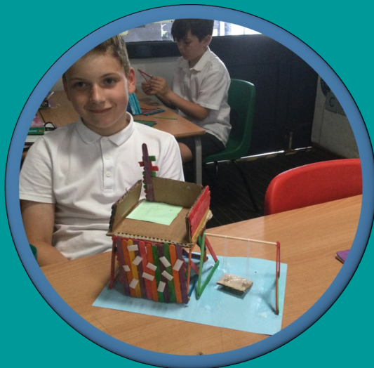
Dolphins in DT designed and constructed their own playgrounds.