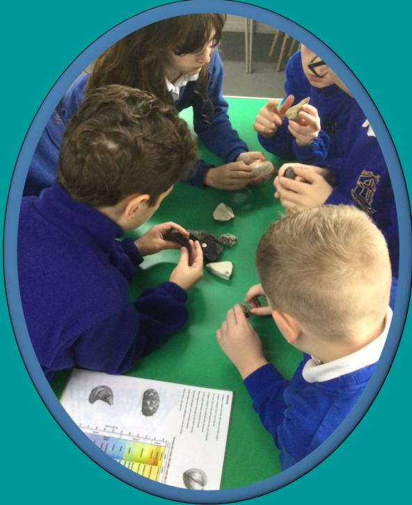
Otters visited Irchester Country Park to learn about fossils