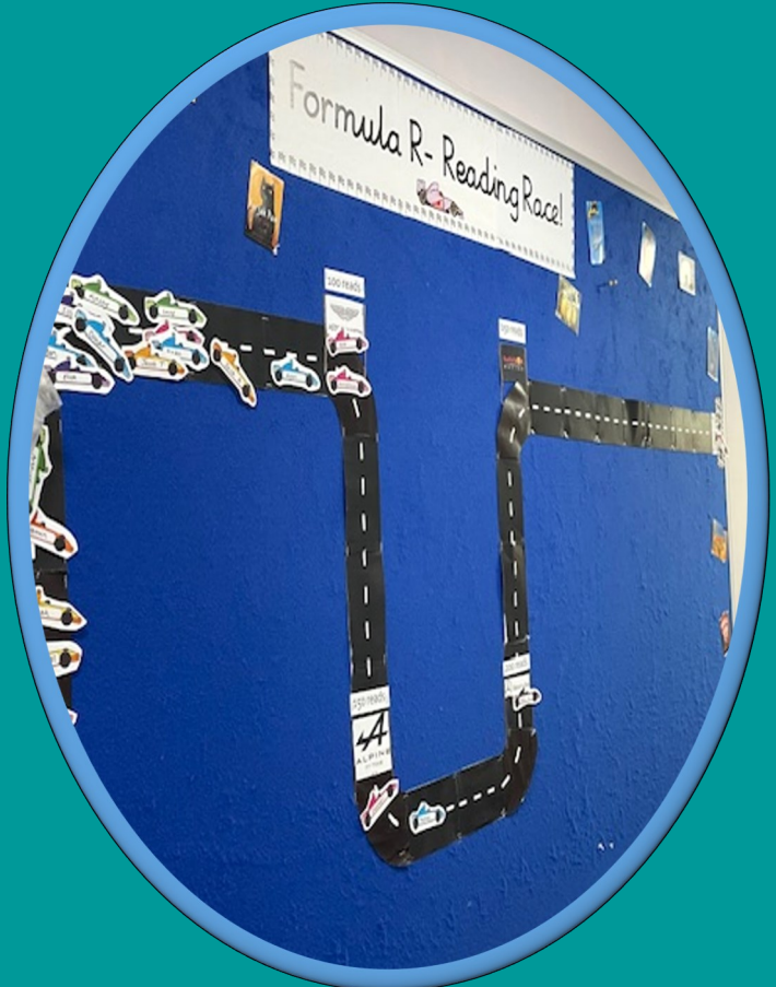
The Reading Challenge Board—Pupils' cars are zooming along the track to the finish line and the checked flag.