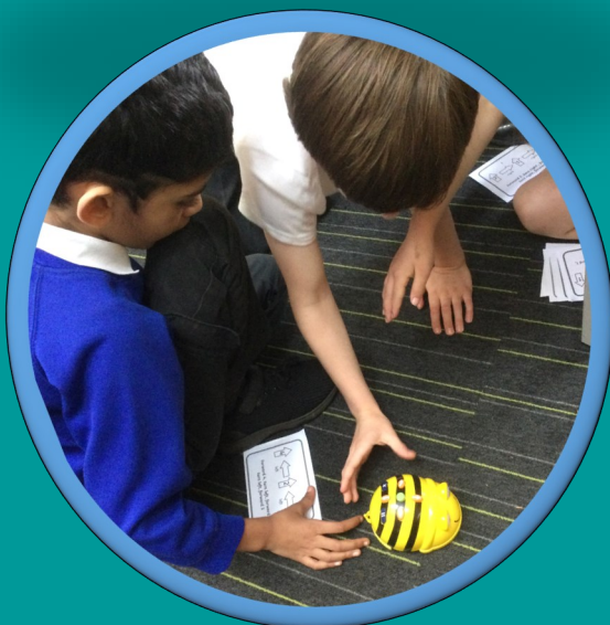
Hedgehogs have been programming Bee-bots to move forward, back and left and right.