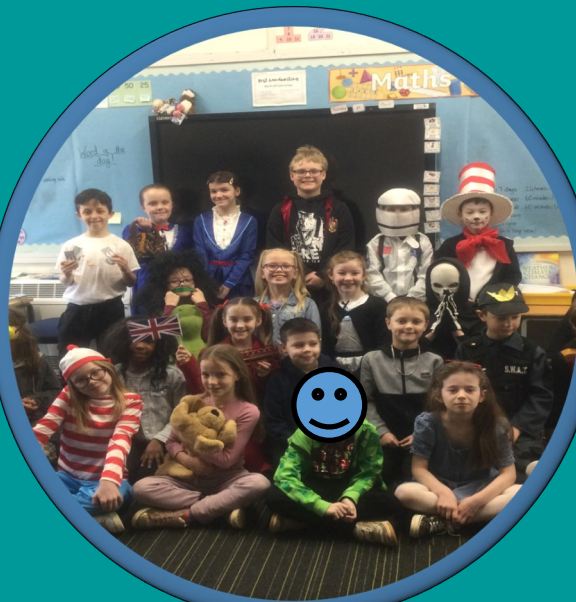
Our pupils in all classes dressed up as book characters for World Book Day on Thursday 7th March. (Pictured some from Otters class)