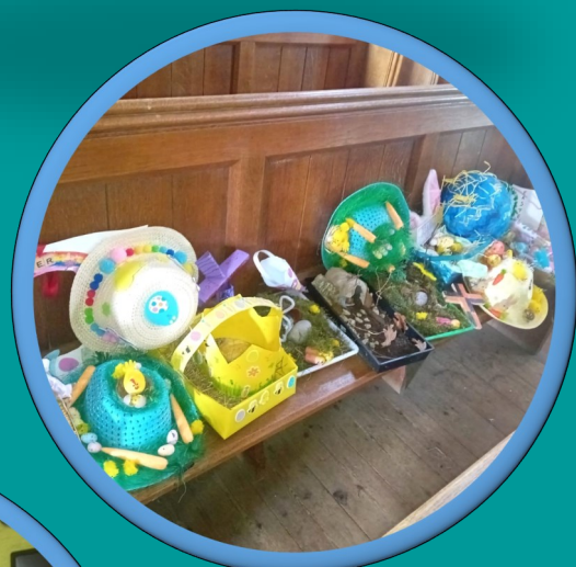
Above: Hedgehogs Homework was being displayed at the church for the Easter Weekend.