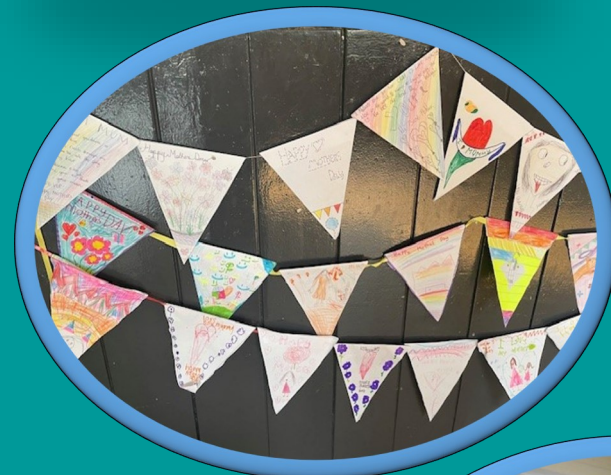
The children made very colourful and cheery bunting for the Mother's Day Tea Party that were also displayed in church on Mothering Sunday.