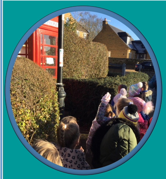
Ladybirds have been enjoying weekly welly walks in the winter sunshine.