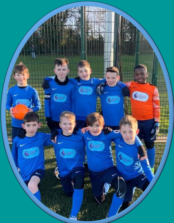
A great result for our Year 5 & 6 Football Team . They came 5th Place in the county final .